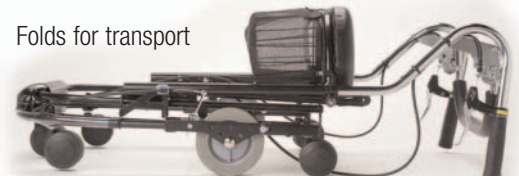
Folds for transport