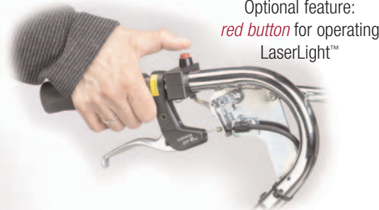
Optional feature: red button for operating LaserLight™